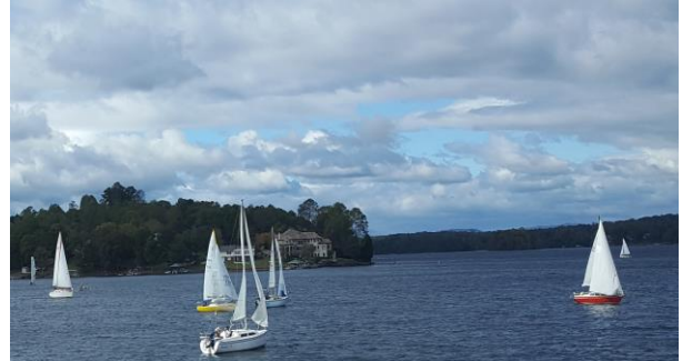
FALL ON LAKE KEOWEE